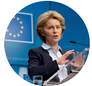
President von der Leyen, State of the Union Address 2020

“Where is the essence of humanity when every single day Roma people are excluded from society and others are held back simply because of the colour of their skin or their religious belief?”